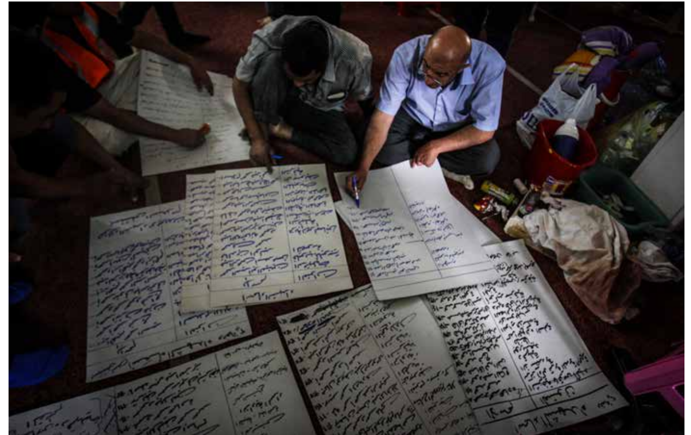
Volunteers in Iman Mosque, near Rab'a Square in eastern Cairo, on August 15, 2013 catalogue the bodies they received in the aftermath of the violent dispersal of the sit-in the previous day. By the end of the day, lists with 257 names were hung from the mosque's walls, all of whom had been among the at least 817 people killed during the Rab'a dispersal.

On the same day as the Rab'a dispersal, August 14, security forces also dispersed a second smaller encampment of Muslim Brotherhood supporters in al-Nahda Square, near Cairo University in Giza in greater Cairo. The al-Nahda dispersal followed the same pattern as in Rab'a: at around 6 a.m. security forces demanded from