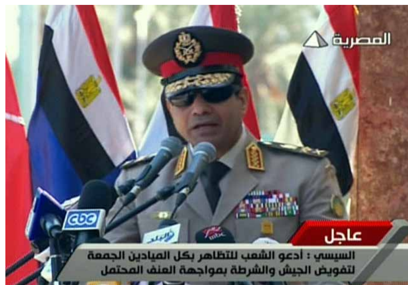
Then-Deputy Prime Minister for Security Affairs Abdel Fattah al-Sisi in a speech at an army graduation ceremony broadcast live on state television on July 24, 2013 calls on Egyptians to take to the streets to “to give [him] a mandate and an order to confront potential violence and terrorism.” On July 26, tens of thousands of Egyptians gathered in orchestrated demonstrations in Tahrir Square and across Egypt to answer his call. Hours later, in the early morning of July 27, police opened fire on a march of pro-Morsy supporters near the Manassa Memorial in Cairo, killing at least 95 demonstrators. The next day, the Egyptian National Defense Council, on which al-Sisi served, met to begin planning the Rab’a and al-Nahda dispersals and on July 31 the cabinet, citing a popular mandate to “fight violence and terrorism,” approved the Interior Ministry’s dispersal plan. Al-Sisi was elected president in June 2014.

Both the police and army took part in the attacks on demonstrators. Army units played the primary role in confronting demonstrators outside the Republican Guard headquarters on July 5 and 8, though police participated as well. Police dispersed the July 27 march outside the Manassa Memorial and the August 16 demonstration in Ramses Square. Police, including both Central Security Forces (CSF) and Special Forces (ESF), took the lead role in the Rab’a and al-Nahda dispersals, though the army played a critical role. Army forces secured the entrances, inhibiting protesters from entering and exiting, operated some of the bulldozers that cleared the way for police to advance, operated some of the helicopters, including Apaches, that flew over the square, and opened a military base adjacent to Rab’a Square to snipers. Police officers led the advance into Rab’a Square and appear to be responsible for most of the force used there.