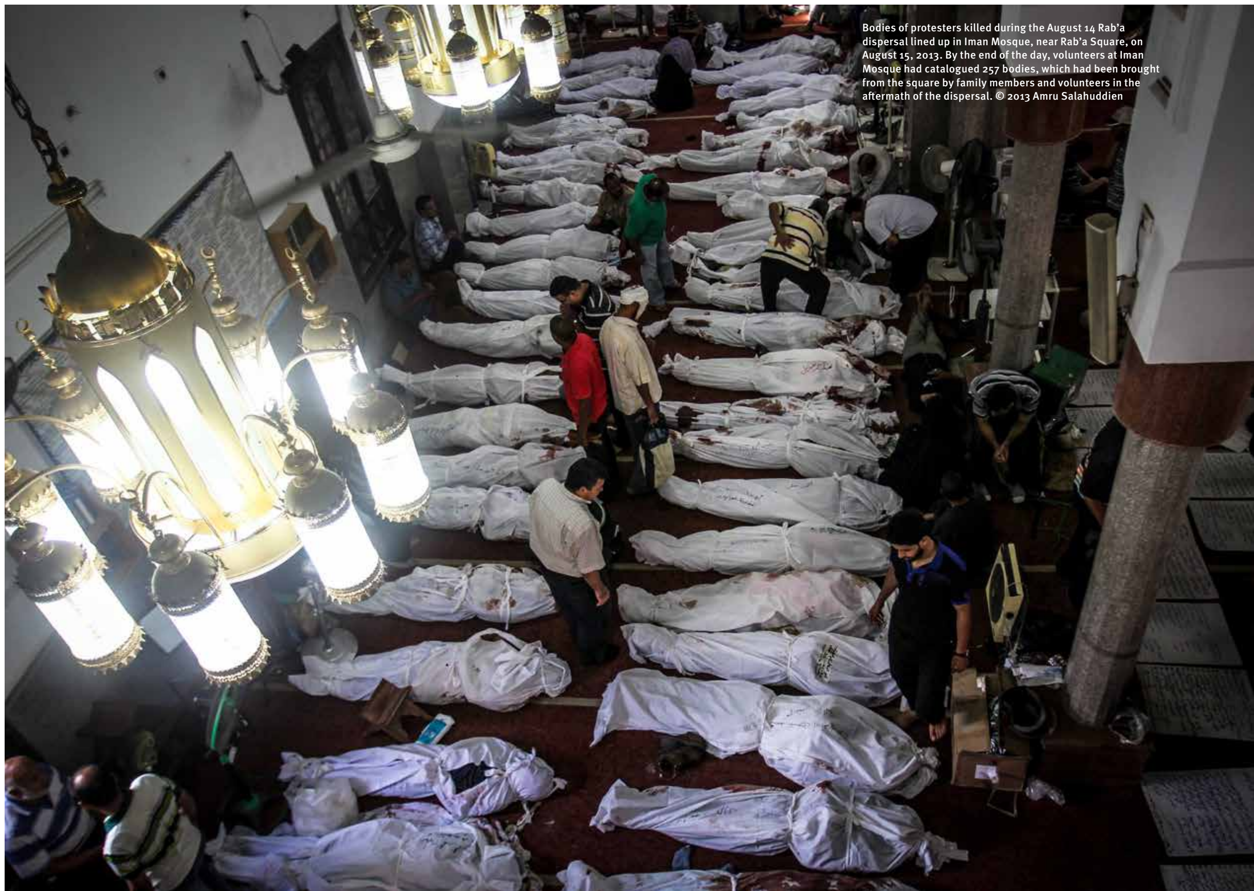
Bodies of protesters killed during the August 14 Rab'a dispersal lined up in Iman Mosque, near Rab'a Square, on August 15, 2013. By the end of the day, volunteers at Iman Mosque had catalogued 257 bodies, which had been brought from the square by family members and volunteers in the aftermath of the dispersal.

Extensive witness evidence, including from independent observers and local residents, establishes that the number of arms in the hands of protesters was limited. In In-