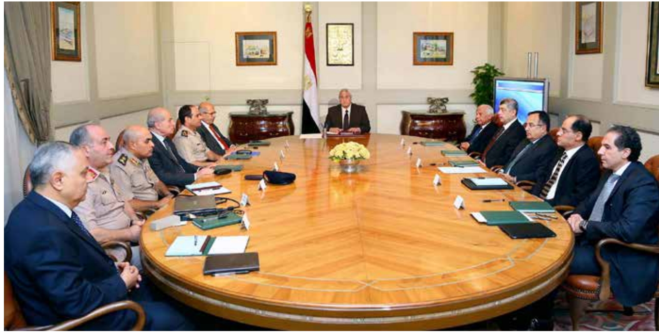
Egypt's National Defense Council (NDC), chaired by Interim President Adly Mansour and consisting of leading civilian and security officials, meets in July 2013. On August 4, the NDC formally reviewed and approved the plan to disperse the Rab'a and al-Nahda sit-ins drafted by the Interior Ministry. According to security sources, the plan anticipated several thousand casualties. On August 15, the day after the dispersal, Interior Minister Mohamed Ibrahim told Al-Masry al-Youm that "the dispersal plan succeeded 100 percent."

to protect an imminent threat to life—a standard that was far from met in this case.