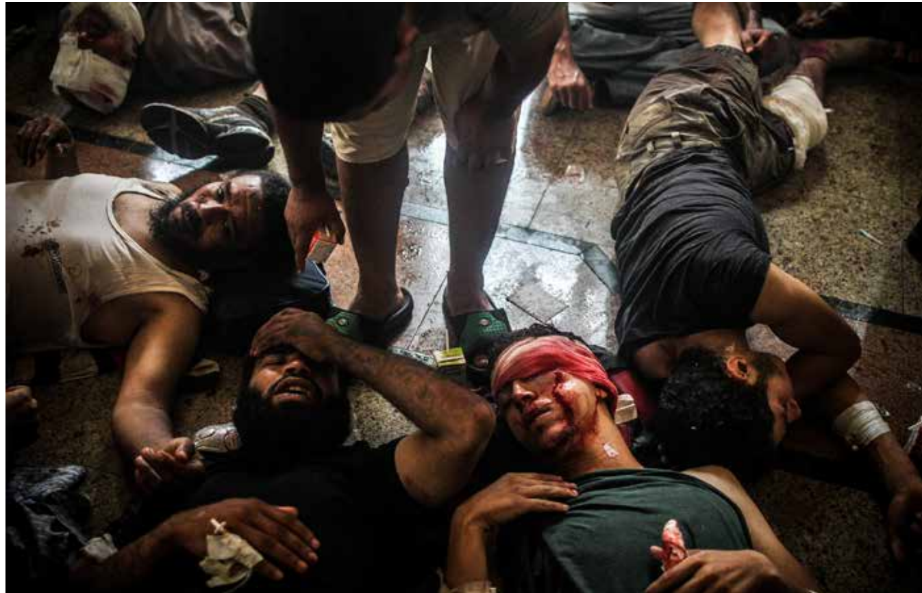
Injured protesters rest in a makeshift field hospital in Rab'a Square, where overwhelmed volunteer doctors tended to the hundreds of injured and dead protesters in the midst of August 14 dispersal of the Rab'a sit-in. Security forces besieged protesters for nearly 12 hours without safe exit, including for injured protesters in need of medical attention.

terior Minister Ibrahim's August 14 press conference, in fact, he announced that security forces had seized 15 guns from the Rab'a sit-in. In an August 18 speech, then-Defense Minister Abdel Fattah al-Sisi said referencing the Rab'a dispersal that, "I am not saying everyone was firing, but it is more than enough if there are 20, 30, or 50 people firing live fire in a sit-in of that size." If the figure of 15 guns is an accurate representation of the number of protester firearms in the square, it would indicate that few protesters were armed and further corroborates extensive evidence compiled by Human Rights Watch that police gunned down hundreds of unarmed demonstrators.