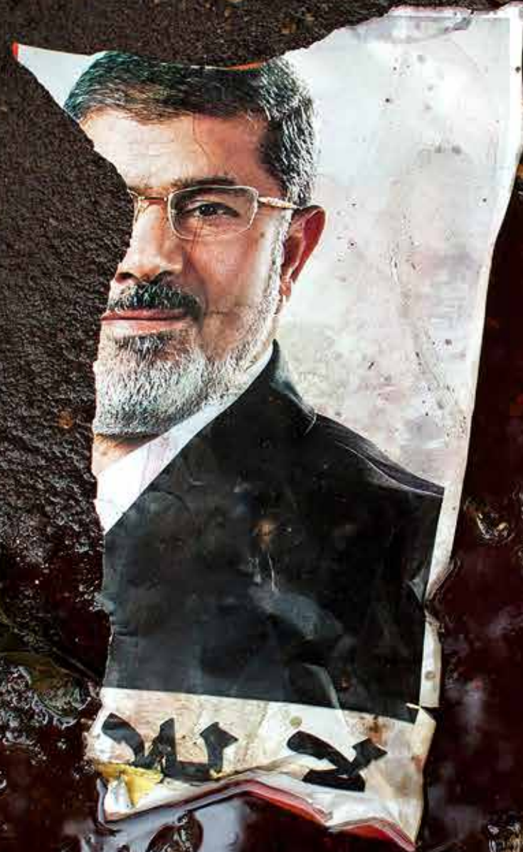
A ripped up poster that reads 'No to the Coup', in reference to the military's ouster of Morsy on July 3, 2013 lies in a pool of blood in Rab'a Square on August 15, 2013.

Over the course of the following two months, Muslim Brotherhood supporters organized two large sit-ins in Cairo and smaller protests across Egypt to denounce the military takeover and demand the reinstatement of Morsy. In response, police and army forces repeatedly opened fire on demonstrators, killing over 1,150, most of them in five separate incidents of mass protester killings.