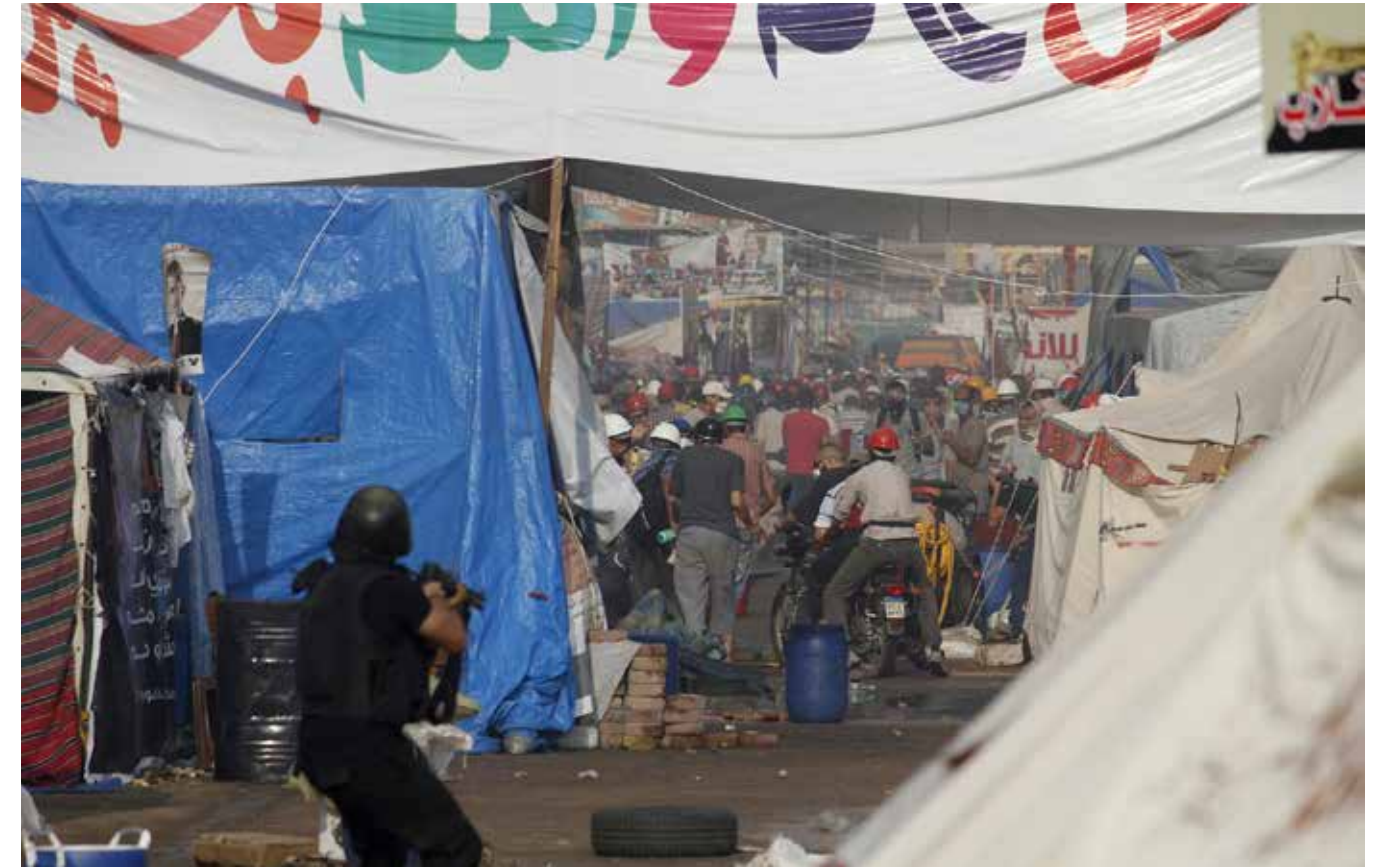
An officer from the Egyptian Central Security Forces (CSF) takes aim at a crowd of retreating protesters as security forces disperse the Rab'a sit-in on August 14, 2013.

The indiscriminate and deliberate use of lethal force resulted in one of the world's largest killings of demonstrators in a single day in recent history. By way of contrast, credible estimates indicate that Chinese government