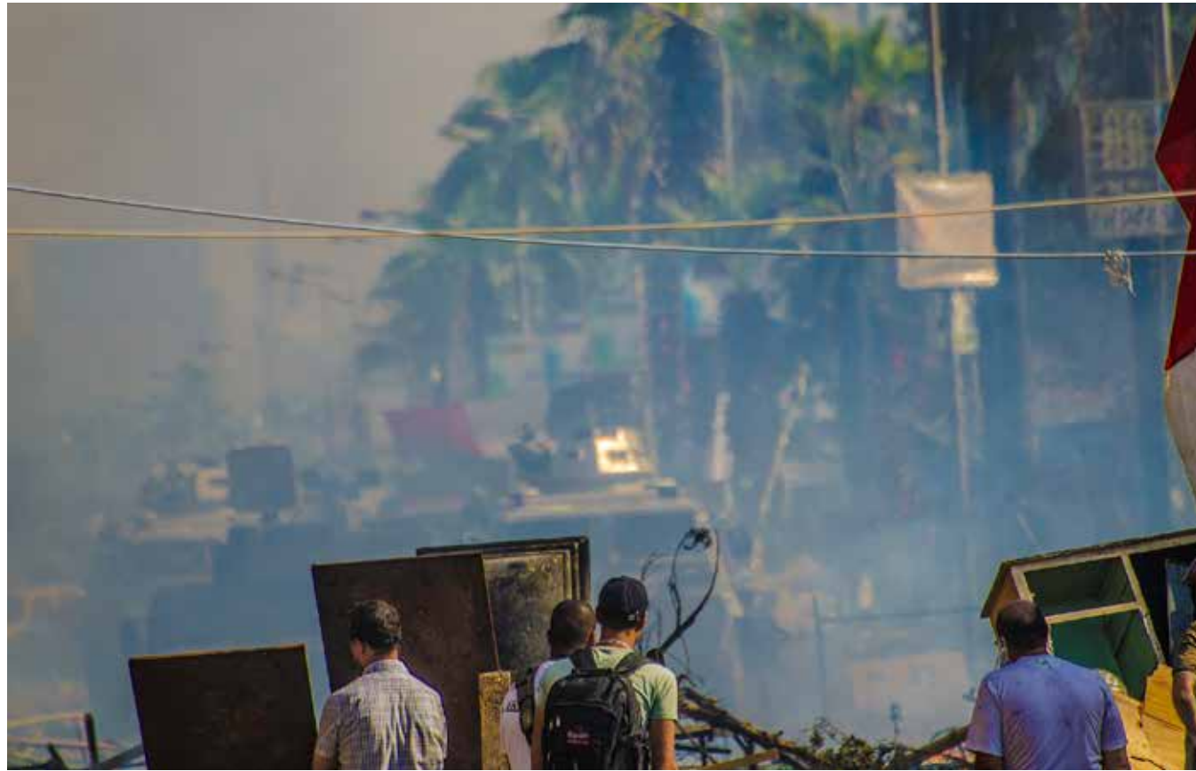
Armed personnel carriers (APCs) operated by the Egyptian police approach protesters assembled behind makeshift fences in Rab'a al-Adawiya Square in eastern Cairo on August 14, 2013.

protest encampment, where demonstrators, including women and children, had been camped out for over 45 days, and opened fire on the protesters, killing at least 817 and likely more than 1,000.